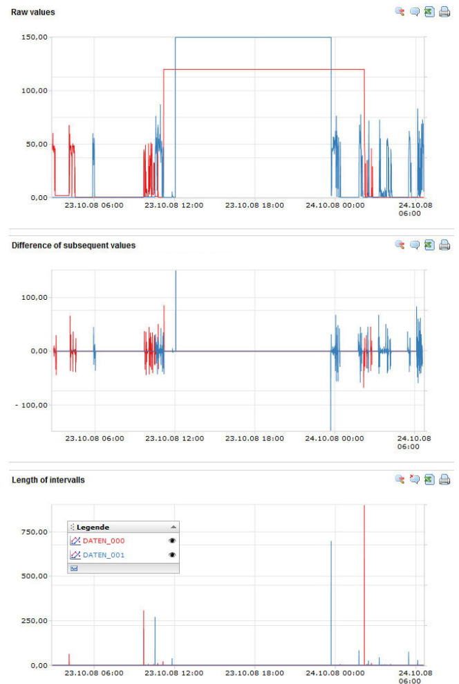
Figure 4: Quality issues with the data values (km/h values) of a GPS data set (containing data of two cars, represented by different colors). In the first chart we see the raw data values laid out along a time axis with suspicious, long lasting high values in the middle. The second chart is a difference plot revealing very high velocity changes at the beginning and end of long lasting high values from the first chart – this substantiates the initial suspicion that this is an error. The third picture shows the length of the time intervals for which these values are recorded. We can see that these constant high velocity values are given for unusual long intervals (in contrast to several short intervals with the same km/h values) – another indication that these selected entries differ from the majority of data entries in this data set.

functionality of TimeCleanser. Moreover, we conducted a focus group to learn more about target users' opinions in order to identify further directions and to get feedback regarding user satisfaction with the TimeCleanser prototype. The focus group was guided in order to get answers to the following research questions: (1) Does the prototype help the target users (i.e., the analysts) in their working steps to perform data cleansing tasks? (2) Is an integration of visualizations methods useful? (3) What are the advantages and disadvantages in comparison with the data cleansing methods they have used so far? (4) For which tasks are visual-