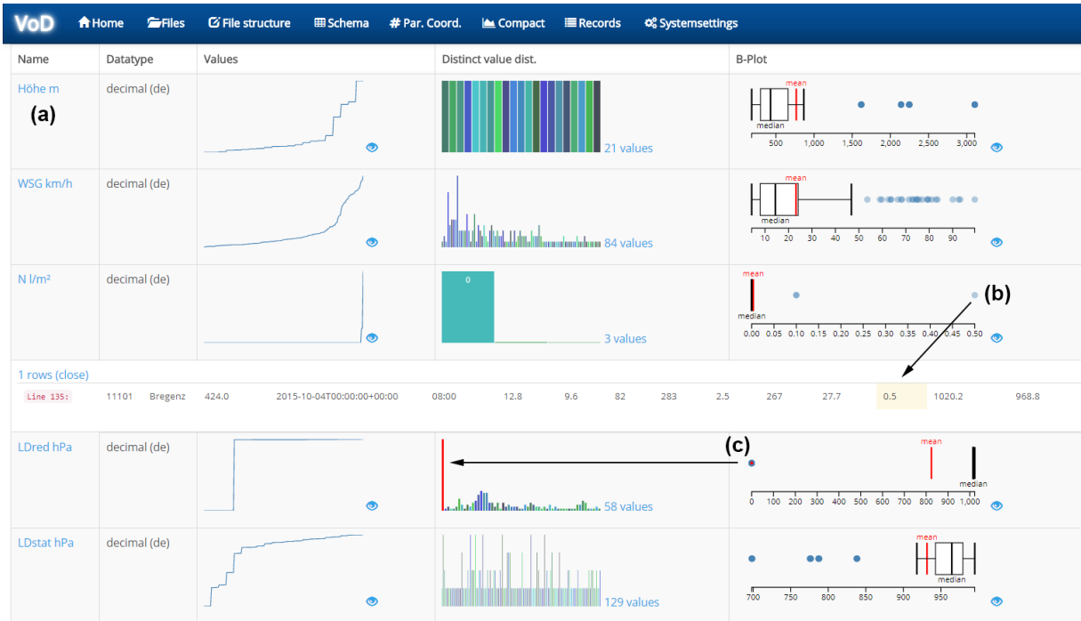
Figure 1: VoD is a web application that provides summaries of datasets with multiple tabs to show different aspects of the data. The Compact page shows different visualizations that in combination help to get a compact overview of the dataset (on the data value level) and possible quality problems. The scroll-able page represents each data attribute in a separate row (here cropped for readability). Row (a) represents the data attribute 'Höhe m' which gives the height of air quality measurement stations. A line chart shows the individual sorted data values in this column. The bar chart showing the quantity of distinct values reveals that there are exactly 21 different heights in this data set corresponding to the 21 measurement stations. The box plot shows that most data elements are measured at stations on lower heights with some exceptions. These data values look plausible. In (b) we see an outlier (far right dot in the box plot) in the amount of precipitation (the data attribute represented in this table row). When selecting this outlier, a row appears below showing the corresponding data entry. As almost all measurements of precipitation were 0 l/m 2 (as can be seen in the bar chart), 0.5 l/m 2 still seems legit and we reason that this is a correct measurement. Hovering the outlier in (c) highlights the corresponding bar in the bar chart in red. This shows that many data entries of '0' correspond to this outlying position. The line chart as well as the bar chart show that there is a noticeable difference between these 0 values and the remaining data. These may be missing values and demand for further investigation.