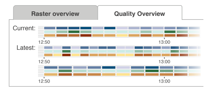
Figure 2: Result quality overview ( truncated ): In this view the user can directly compare quantified quality and uncertainty information of the raster result history for individual rasters encoded in a colored heatmap. The context of the coloring corresponds to the aggregated indicators in Figure 1c and helps to identify conspicuous entries.

The time series rastering preview (cf. Fig. 1a) is interactively browsable, showing a superimposition of both the original time series and a preview of the results of the current rastering configuration. This view also serves as input interface for defining the raster length and initial raster anchor point. These parameters are selected via drag&drop (cf. Fig. 1e) in the rastering preview. During dragging, the raster values are calculated and interactively updated based on the current configuration (grey dotted line in Fig. 1a). The multiple-coordinated views are dynamically updated during the dragging interaction to show the impact of the chosen configuration on the rastering outcome, like raster length, distribution, and possible empty rasters.